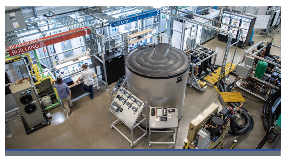
Figure 2. Commercial buildings labs emulate the grid and environment with real building equipment and the ability to switch to any building or location.

Incorporating GEB and decarbonization technologies and equipment into new and existing buildings helps reduce the