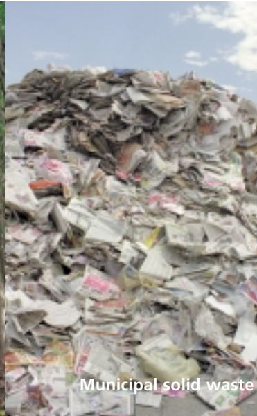
Municipal solid waste