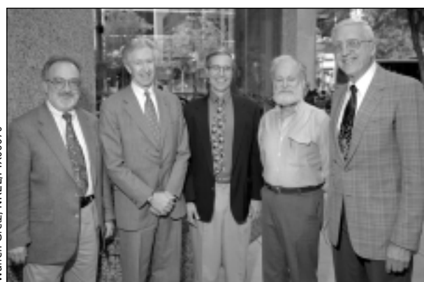
Warren Gretz, NREL/PIX06670

There followed two solid days of oral presentations and poster sessions, on topics covering the whole of the PV Program from the laboratory to the marketplace. The meeting was a showcase for research progress on thin films and crystalline materials, and for achievements in the laboratory and the field involving characterization, components and systems, markets and applications, and PV manufacturing. Eight technical and two poster sessions were well attended by the 257 meeting participants, with some traveling from Japan, Germany, Italy, Israel, and Sweden. All told, there were 48 technical oral