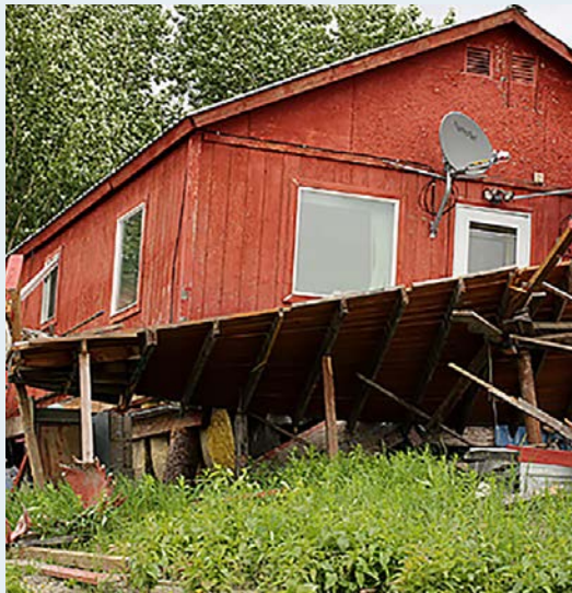
Galena, Alaska, where more than 200 homes were destroyed when the Yukon River flooded in 2013.

Through their work on the President's State, Local, and Tribal Leaders Task Force on Climate Preparedness, Mayor Reggie Joule (Northwest Arctic Borough, AK) and Chairwoman Karen Diver (Fond du Lac Band of Lake Superior Chippewa Indians, MN) gathered input from hundreds of tribal leaders to answer a pressing question: How can the federal government better support tribal communities in preparing for and responding to the impacts of climate change? The input formed the basis of a supplemental set of tribal recommendations that were released during the White House Tribal Nations Conference in December and are available online at www.whitehouse.gov/sites/default/files/docs/climate_change_task_force_tribal_recommendations_0.pdf .