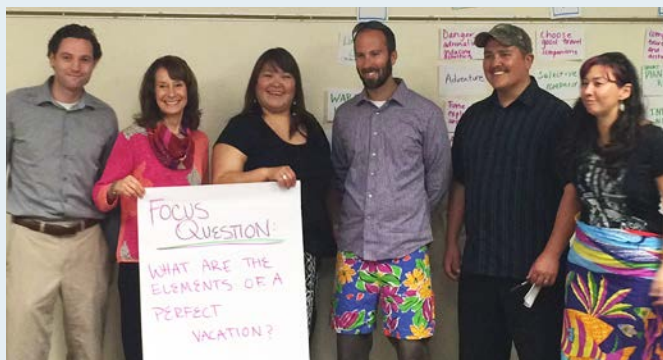
More than 20 representatives of state and regional organizations participated in the first Ambassadors training in Anchorage.

So far, there have been two in-person trainings and a webinar designed to equip the Ambassadors with tools and guidance for helping Native villages complete the tasks outlined in the Alaska Strategic Energy Planning Handbook : www.energy.gov/indianenergy/downloads/alaska-strategic-energy-plan-and-planning-handbook . Learn more at www.energy.gov/indianenergy/articles/energy-ambassadors-provide-front-line-support-alaska-native-villages .