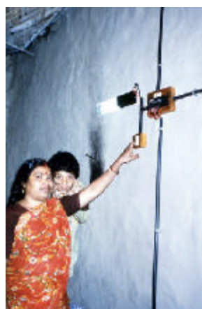
Figure 3. Where there was once darkness, there is now light.

Homeowners were asked what they used for lighting before PV. The majority used hurricane lamps that use kerosene. Their fuel charges were 60 to 80 rupees per month. This provided two lamps for 4 hours per night.