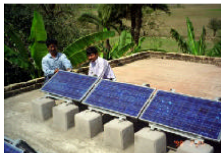
Figure 6. Installing PV modules on the village clinic