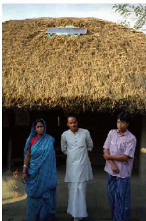
Figure 2. Solar home lighting system mounted on home owner's thatched roof

social and economic impacts. It is hoped that the experiences in the Sundarbans can be replicated in other regions of the world experiencing a similar lack of access to electricity.