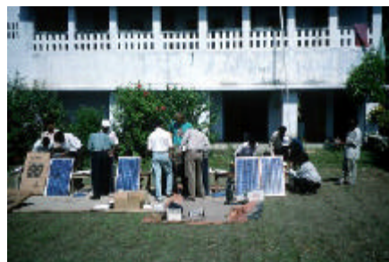
Figure 5. Hands-on training offered to RKM personnel