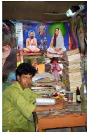
Figure 4. Where there is light there will be knowledge—a student studies under light powered by photovoltaics