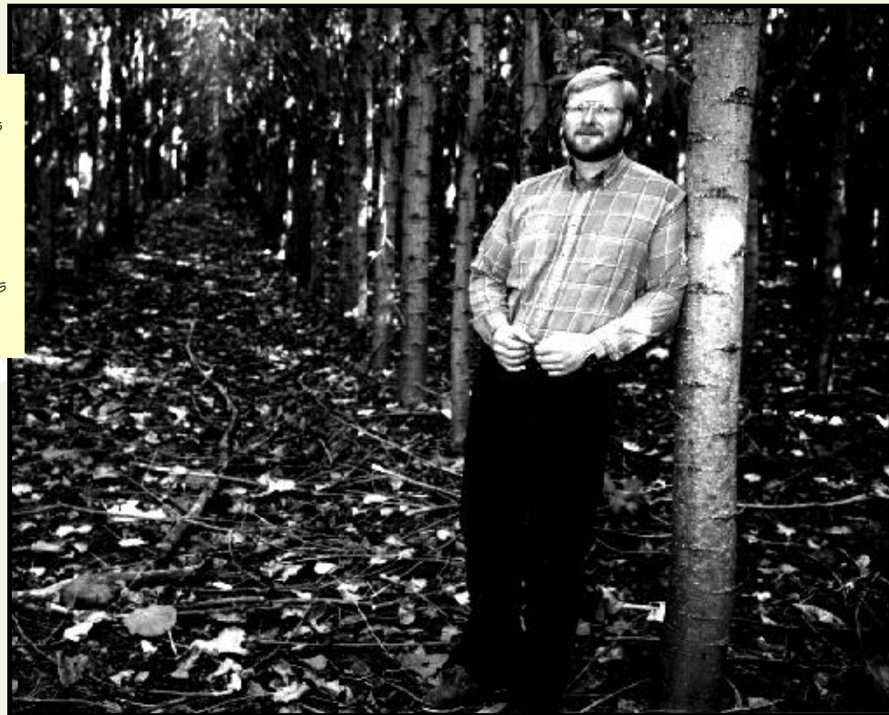
Walter Grez, NREL

Don Rice, a supervisor with James River Corporation, stands in a plantation of hybrid cottonwood trees, which make an excellent energy crop for biofuels production. This crop of trees, which will be used to make paper, is grown near Clatskanie, Oregon.